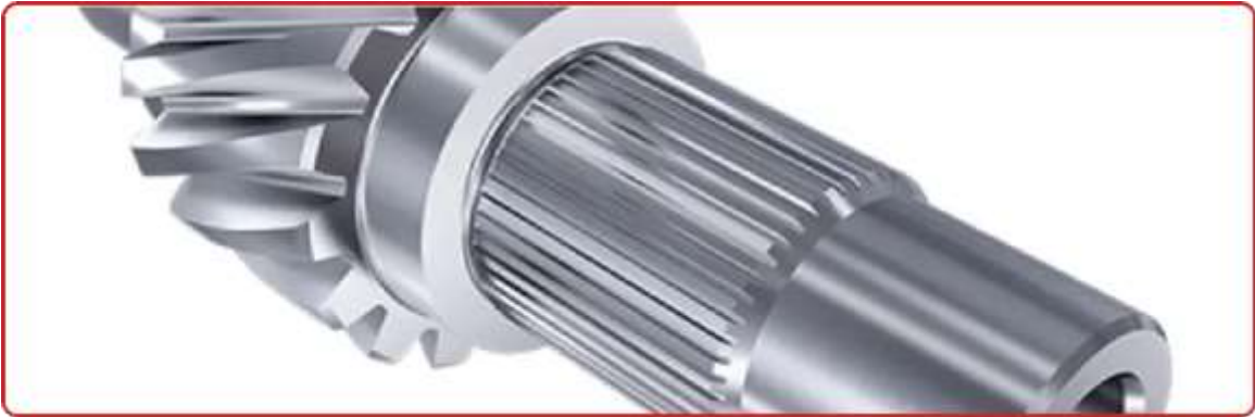
Precision-engineered gear pinion and shaft assembly

Laksh Enterprise offers a complete range of mechanical and industrial components, designed to perform under demanding conditions. Each component is tailored to meet specific technical requirements while complying with relevant international standards.