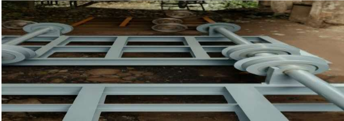
Precision-engineered Trolley wheel Assembly